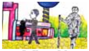
Be Happy, P 5