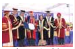
Convocation, P 3