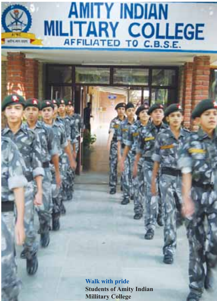
Walk with pride Students of Amity Indian Military College

“Conscription is simply not a practicable proposition in a country as large as ours. The National Youth Policy stipulates that