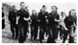
A page in history, P 7